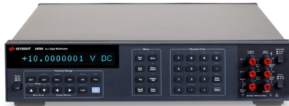
Figure 6. Keysight's high performance 3458A DMM