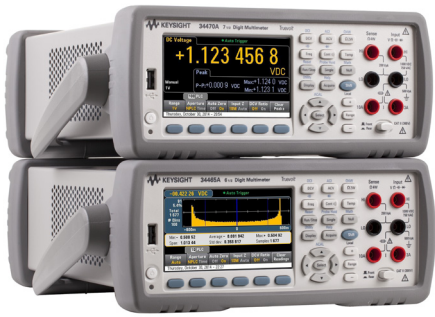
Figure 5. Keysight's Truevolt Series DMMs

For more information about Keysight's Truevolt Series DMMs, please go to www.keysight.com/find/Truevolt and Keysight's 8.5-digit high performance DMM, please go to www.keysight.com/find/3458A