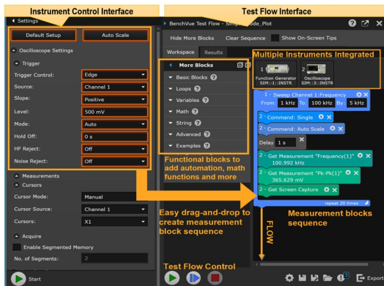
Figure 3. Test Flow Feature Graphical User Interface

Test flow feature enables automated test sequences from multiple instruments. It has an easy to use drag-and-drop graphical user interface to create measurement blocks without the need of programming. There are functional blocks to add various instructions, math functions, advanced tools and more, for a truly automated measurement system. Results tab to preview test flow sequence or to automatically logs and store actual measurement data. Test flow sequences can be saved in a file for reuse or easy sharing in the lab.